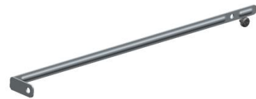
Adjustable Vertical Bracket Z-ULTRA2-VLB