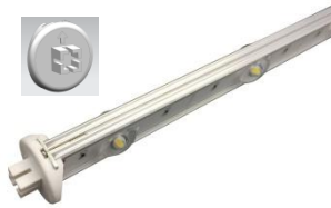
Removable R17D Bracket Z-ULTRA2-HLB