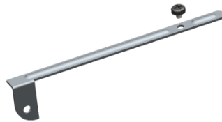
Adjustable Horizontal Bracket Z-ULTRA2-HLB